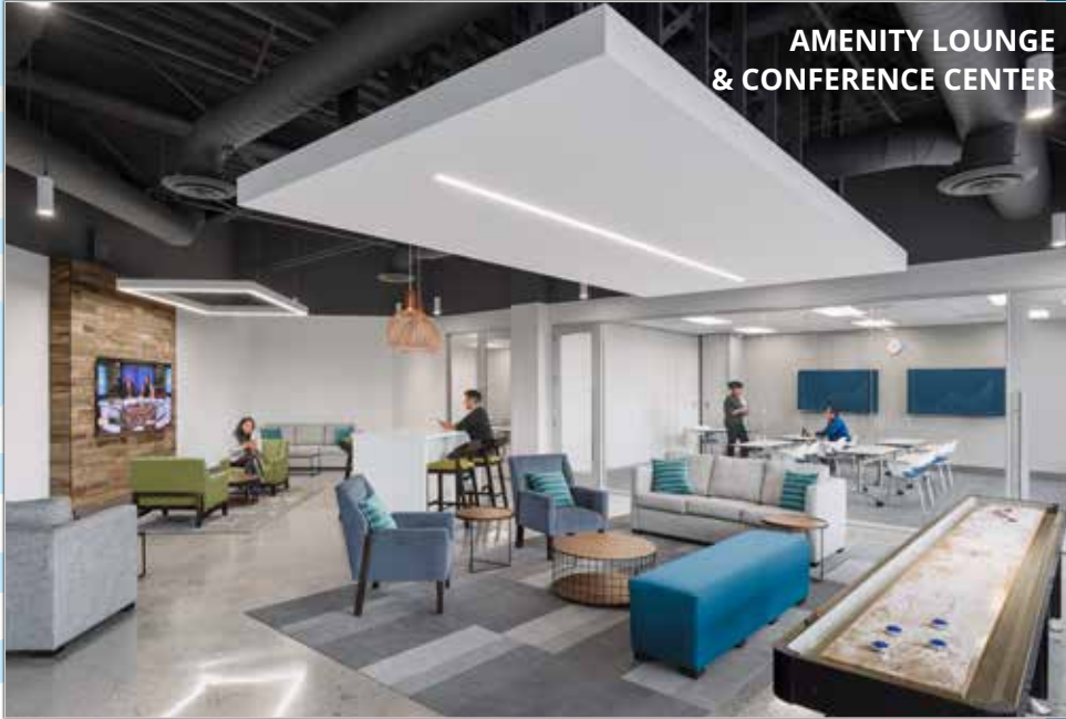
AMENITY LOUNGE & CONFERENCE CENTER